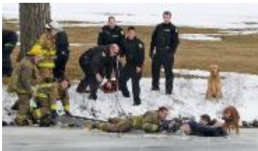
“Niagara Falls Ice Rescue”

To meet the needs of animals, Niagara County created a CART under the Empire State Animal Response Team (ESART) program. Niagara County Department of Health Division of Planning and Emergency Preparedness manages one of two regional trailers which house a small cache of animal sheltering equipment and supplies.