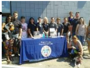
Niagara County CART Microchip Clinic 2013