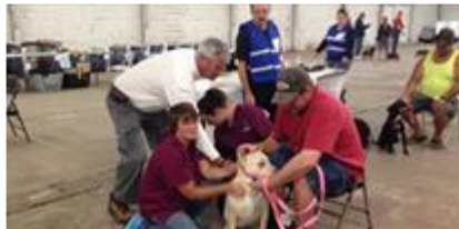
Niagara County CART Animal Sheltering Exercise 2014