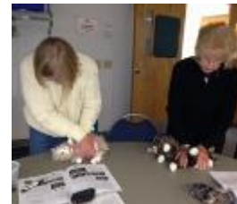
Niagara County CART Animal First Aid & CPR Training 2014