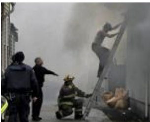
“Residents (and dog) rescued from NT house fire”